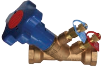
Fig. 9505, with test points

Variable orifice bronze double regulating valve